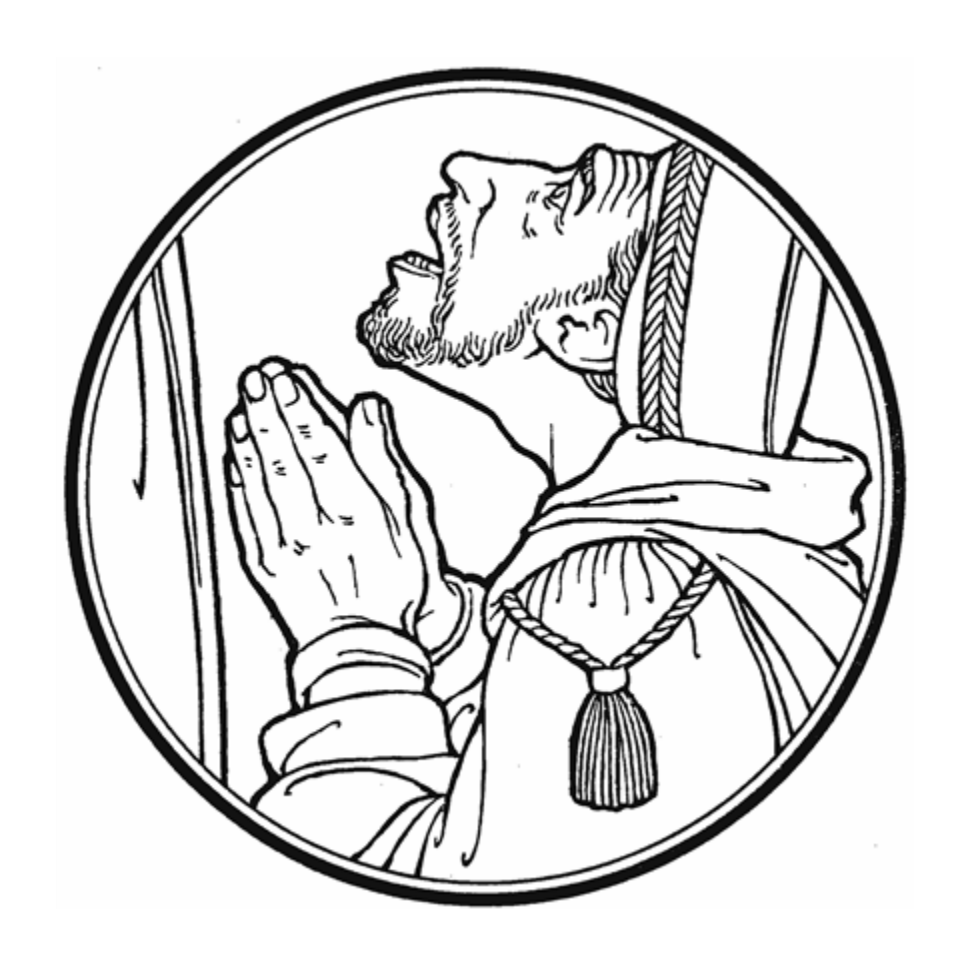
Twenty-First Sunday after Trinity