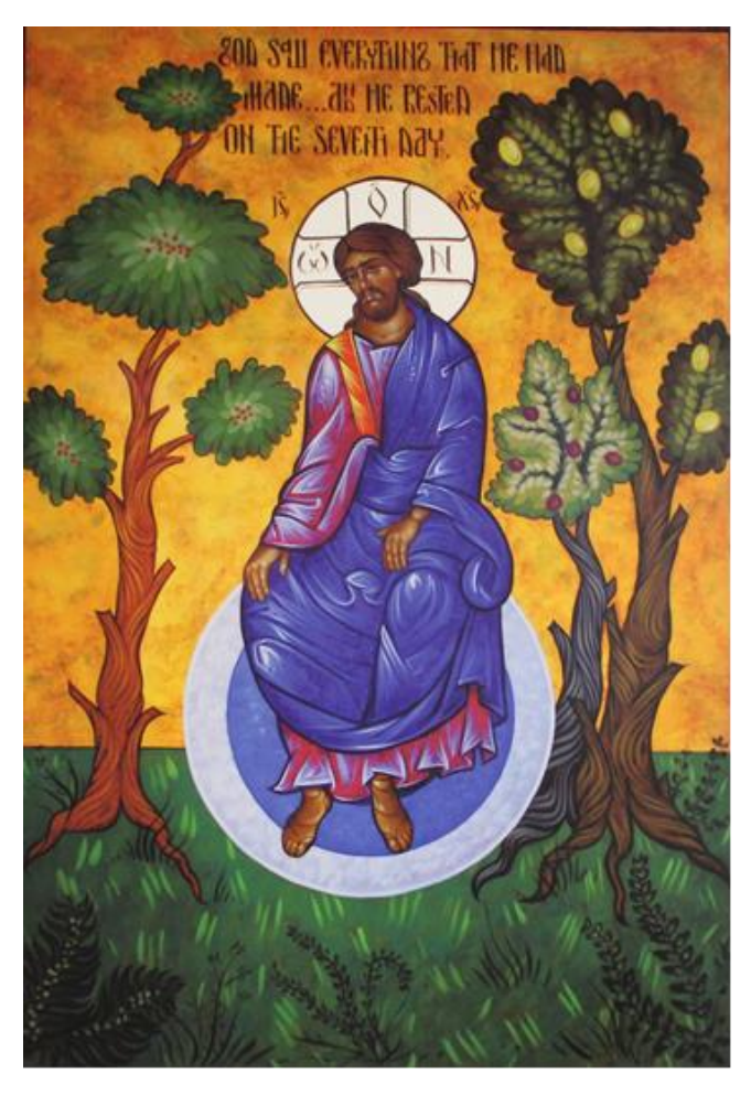
Twenty-First Sunday after Trinity Rovember 10, 2019 Divine Service I