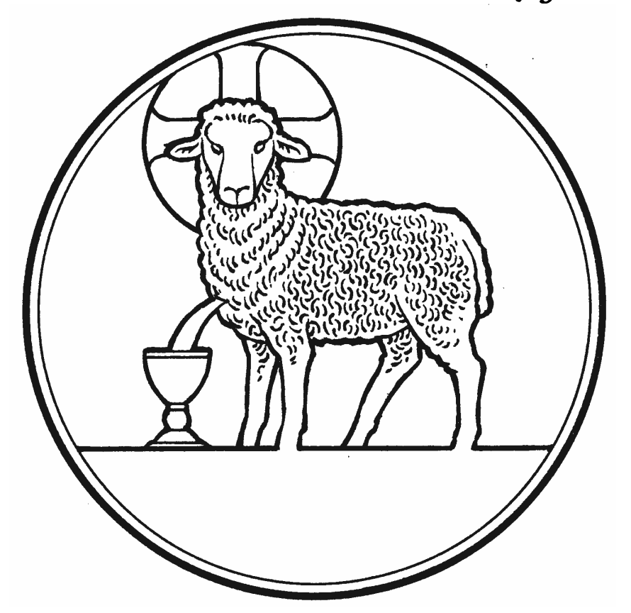
Fourth Sunday in Advent Rorate Coeli December 18, 2016 Divine Service III